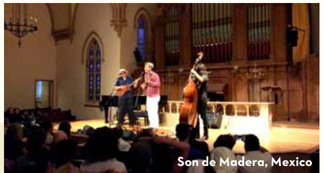
Son de Madera, Mexico