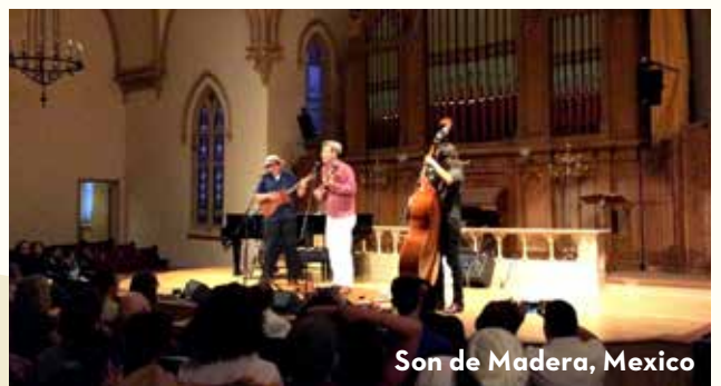
Son de Madera, Mexico