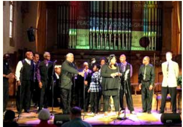
Friday Night Live

2016 began with the transformation of The Old Church into a world-class concert hall. After a successful capital campaign that raised over $250,000 the concert hall now has new stage flooring, state-of-the-art sound and lighting systems, a projector, new pew cushions and numbered seating. The time-period concessions area blends seamlessly with the architecture of Kinsman Hall and our new outdoor marquee announces concerts and events.