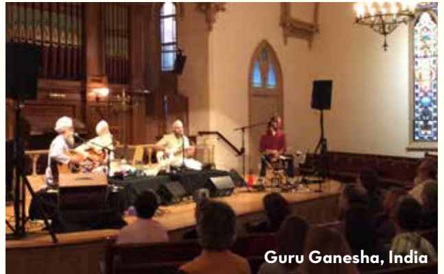
Guru Ganesha, India