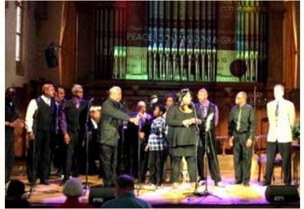
Friday Night Live

2016 began with the transformation of The Old Church into a world-class concert hall. After a successful capital campaign that raised over $250,000 the concert hall now has new stage flooring, state-of-the-art sound and lighting systems, a projector, new pew cushions and numbered seating. The time-period concessions area blends seamlessly with the architecture of Kinsman Hall and our new outdoor marquee announces concerts and events.